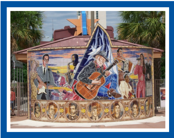
Tribute to Texas Legends • Sunset Station

The effect of Texas' legendary performers is all over the music spectrum ... old and new, rap to gospel. The San Antonio Blues Society has made it our mission to carry forth blues and its traditions in San Antonio.